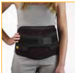
10" Extended Anterior Panel