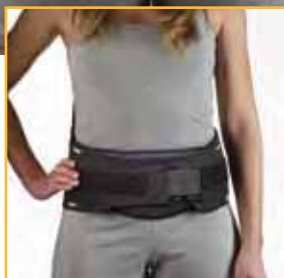
6" Standard Anterior Panel